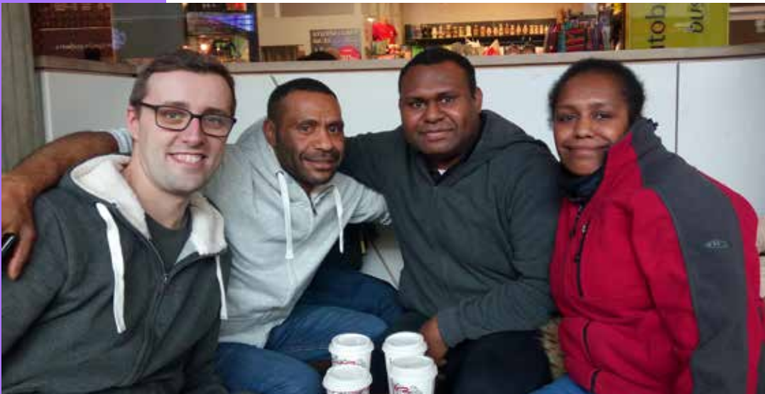
Wantoks are everywhere. With two Math students in Katowice.