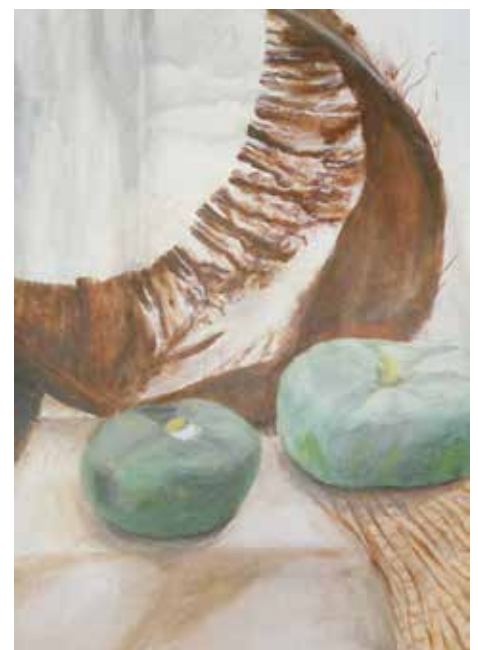
By: bro. Simon Porwol