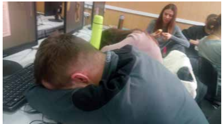
Photos of my of the student daily life and some of my many projects.